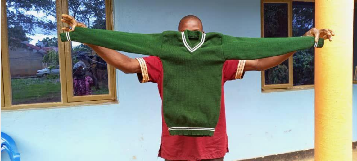
A new program: knitting.

The catering course has been in full swing since 2022: