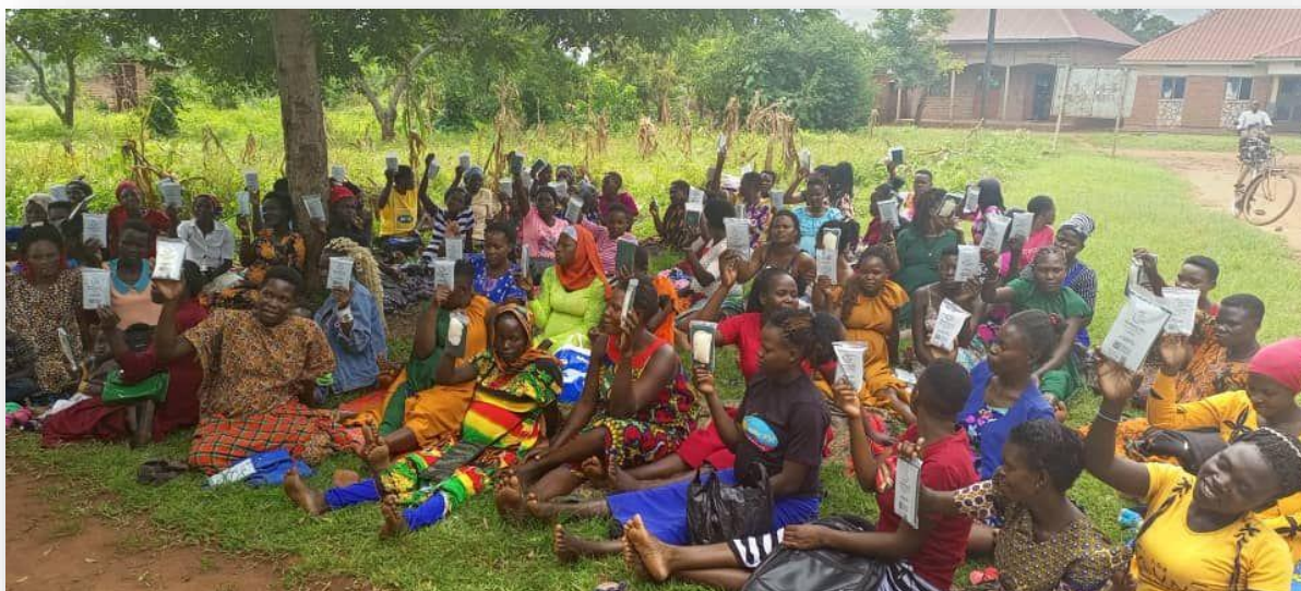
Birthkit handout in 2022

The provision of birthing kits to pregnant women in Jinja and in Kamuli districts is one of the activities that we have run for several years now. And so it continued in 2022. To promote hygiene during birthing, to assist women getting professional assistance during birthing at hospitals and to decrease birth related deaths, we have provided 2000-2500 birthkits to women. The majority of birthkits were distributed in Kisozi, Kiyunga, Bulamka, Kakunyu, Lwanyama, Buluya etcetera.