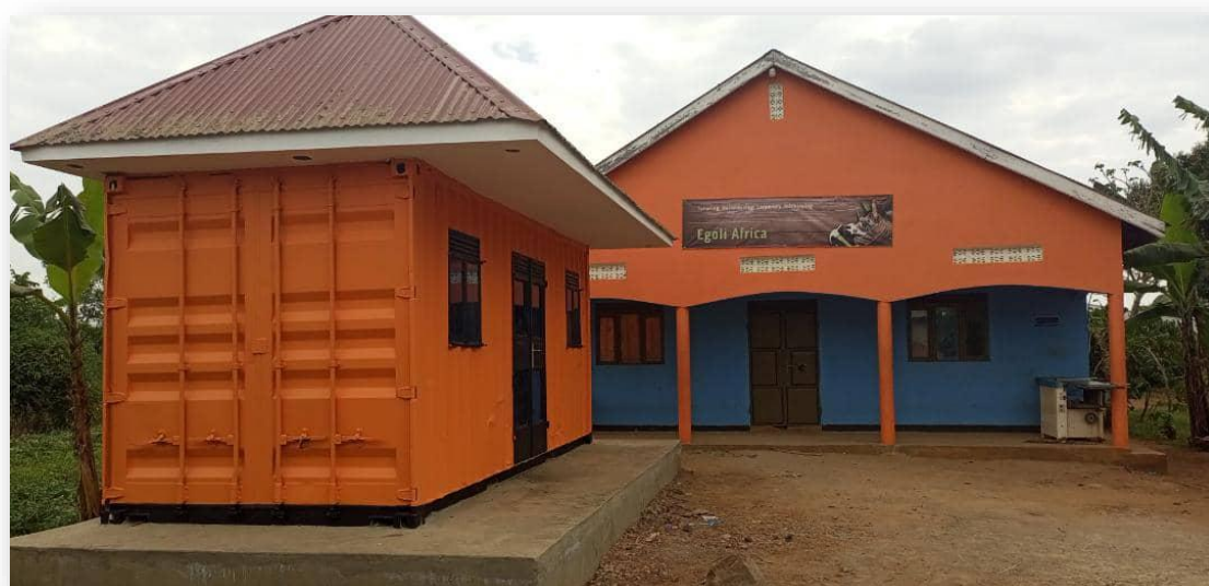
Egoli Africa vocational center and the newly built library

Much attention was paid to promoting the vocational training center and attracting new learners to sign up for the courses offered at the center. The number of learners kept growing which was also due to the expansion of the curriculum.