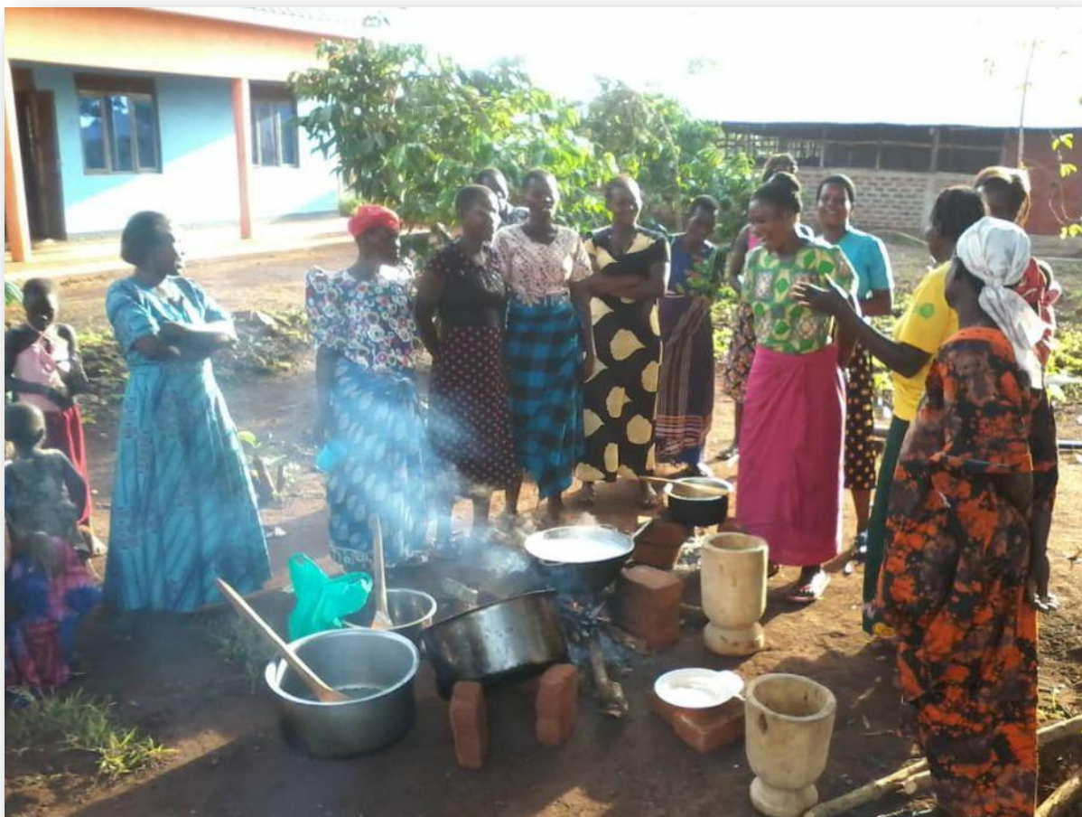
Farm Life, March 2022