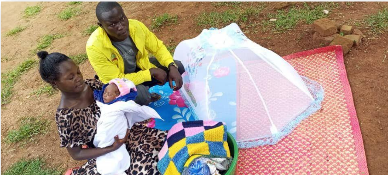
Mommaluv event, July 2022